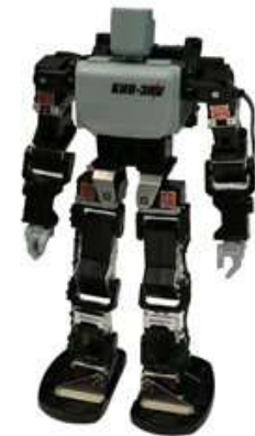
Kondo KHR-3V Japan