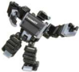
Takara Tomy i-SOBOT