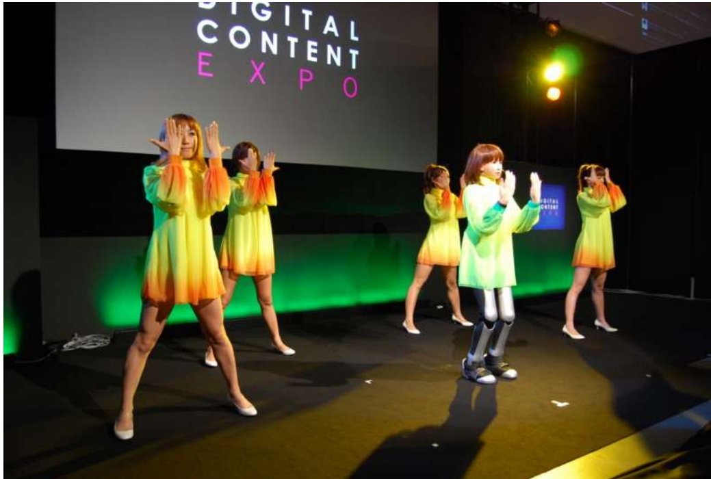
Dancer DIGITAL CONTENT EXPO 2010 with Miim Friends (2010.10.16-17)