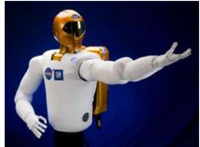
Robonaut 2 NASA, GM