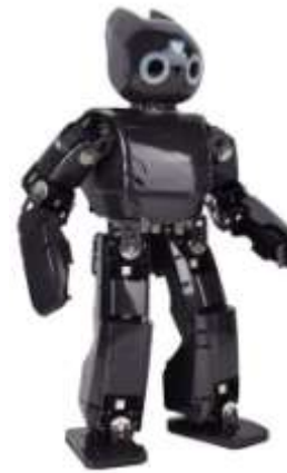
ROBOTIS DARwin-OP USA