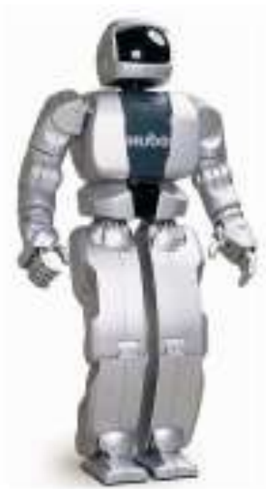
KAIST HUBO Korea