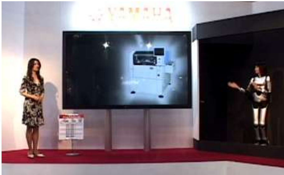
MC (Master of ceremonies) JISSO PROTEC 2010 with YAMAHA VOCALOID (2010.6.2-4)