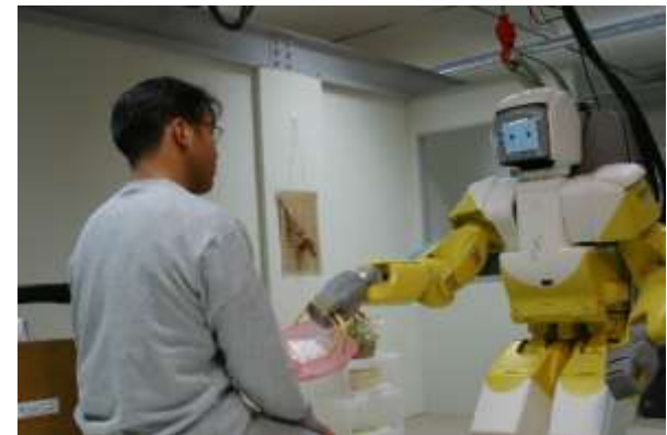
Care Support Services