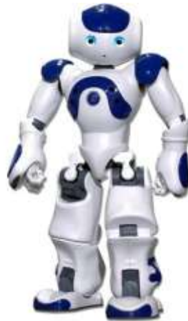
Aldebaran Robotics Nao France