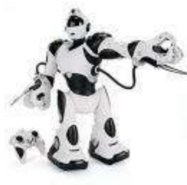
WowWee Robosapien Taiwan