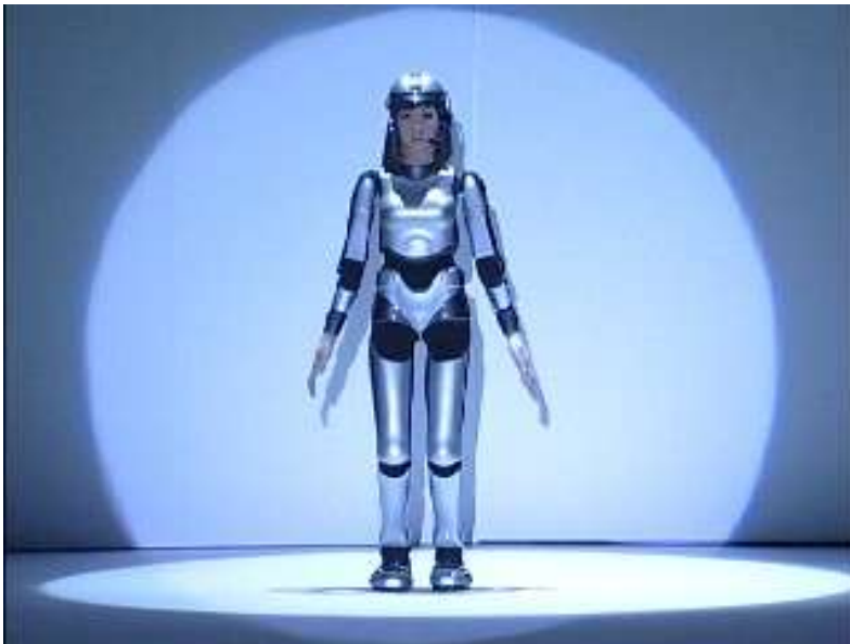
Opening Address SHINMAI Creator's Collection SHINMAI Creator's Project (JFW in Tokyo) (2009.3.23)