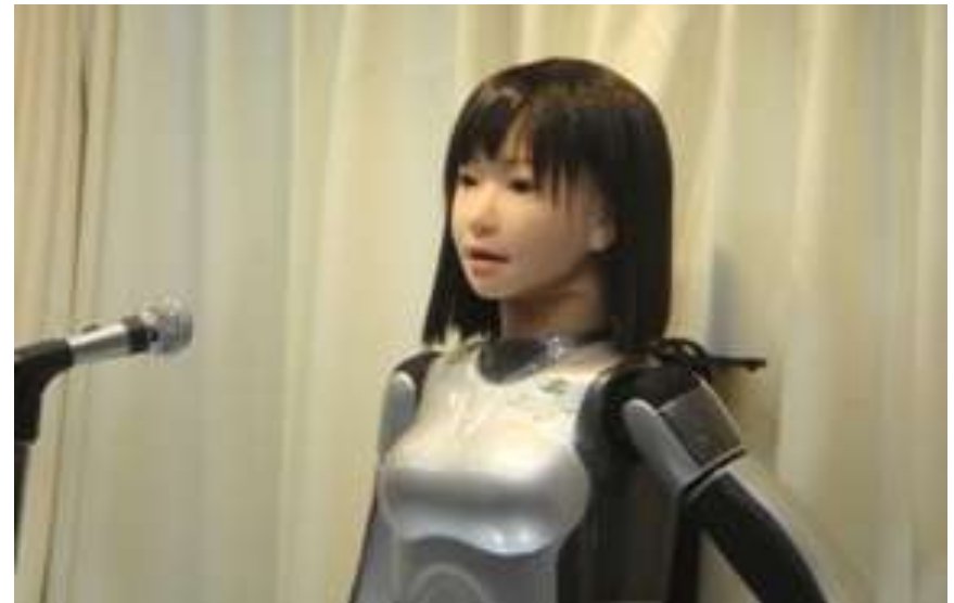
Singer CEATEC JAPAN 2010 with VocaListener and VocaWatcher (2009.10.5-9)