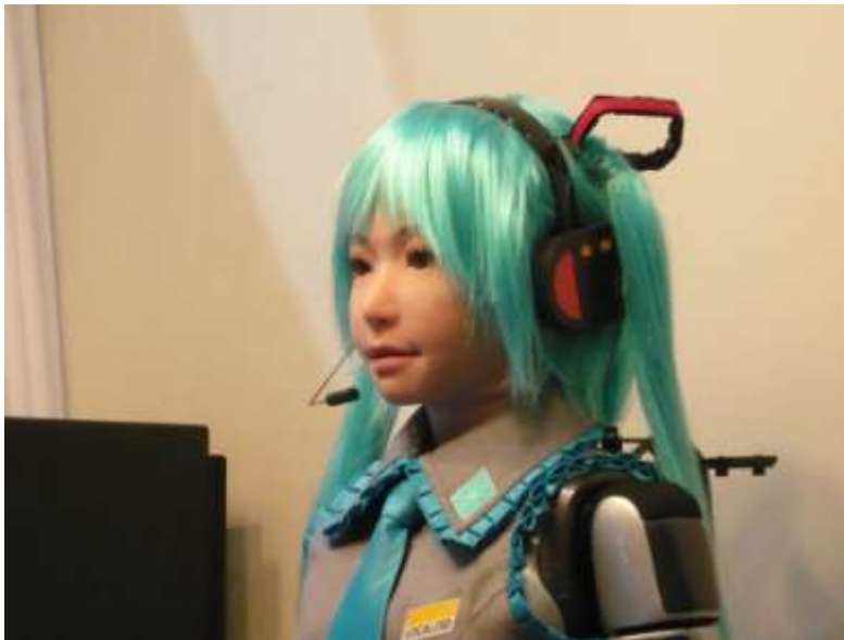
Singer CEATEC JAPAN 2009 with YAMAHA VOCALOID (2009.10.6-10)