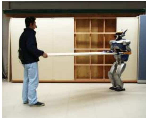
Collaborative Outdoor Works